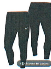
Senior Tech Pant (Black) Optional £20

Please cut here and return reply slip only. Thank you