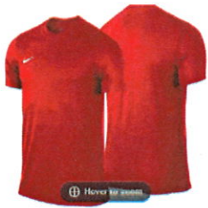
Short Sleeve T-Shirt (Red) Essential £24