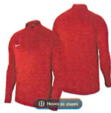
Senior Midlayer Top (Red) Optional £35