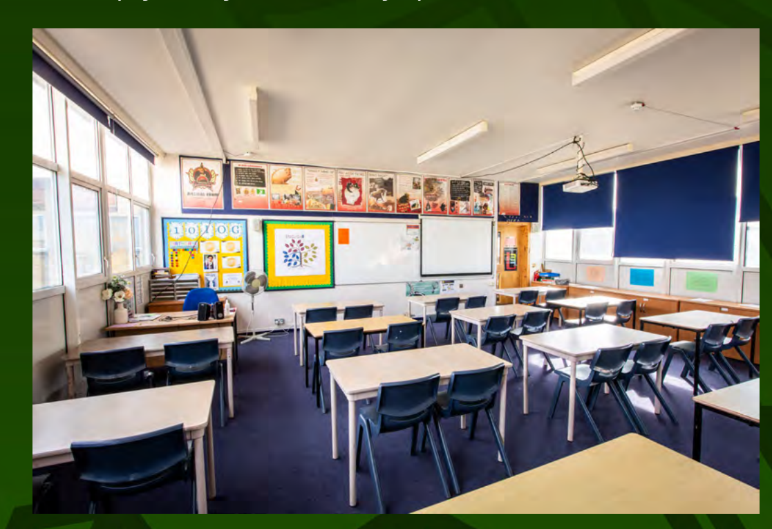
Your Form Room might look like this.

You will be in Year 7. There will be about 145 children in Year 7. There are 5 form groups. You will have a Form Tutor who you will see every morning for Registration in your Form Room. Your Form Tutor can help you if you have any questions.